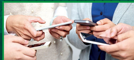
Broadcast Calling Access requests from the call button can ring up to 4 phones simultaneously.