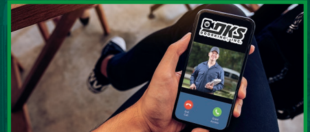
Live Video Streaming Users with the DKS video calling app downloaded to their smartphone are able to communicate with guests via video stream