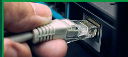
Internet Connection Use your existing internet connection for easy Plug & Play connectivity