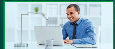
Control from Any Device, Anywhere Administrators can access system settings from any browser via the cloud.