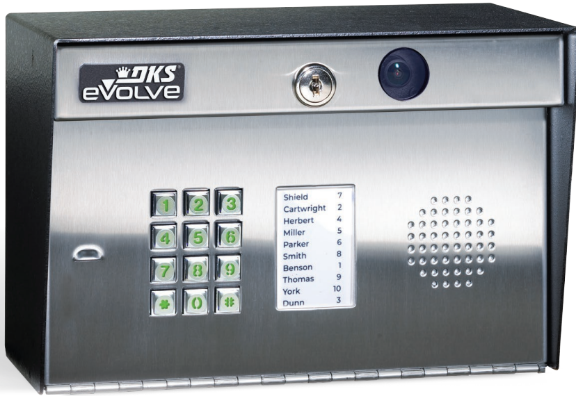
2108 eVolve Surface Mount