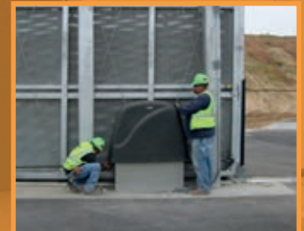
Large Gates up to 15,000 pounds