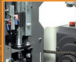
Direct Drive limit switches