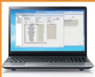
Gate Tracker™ reporting output