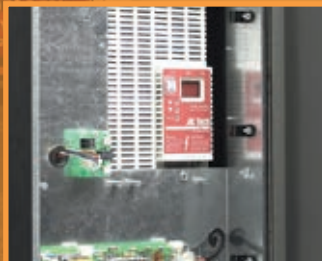
Solid-State variable speed control