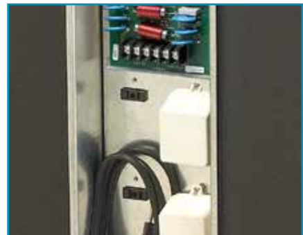
electrical compartment for 4 accessory transformers, and mounting space for surge suppressors and an access control radio receiver