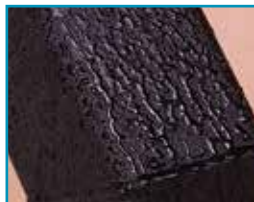
baked on enamel finish for weather resistance