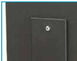
lockable electrical compartment