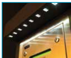
built-in ultra-bright LED lighting