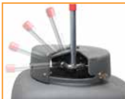
simple manual release