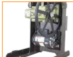
steel frame for strength and durability