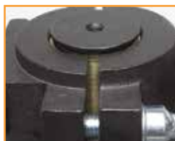
breakaway hub prevents gearbox damage