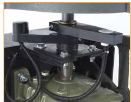
easily adjustable electronic magnetic limits