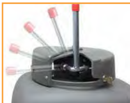
simple manual release