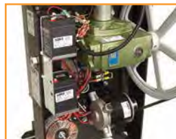
steel frame for strength and durability