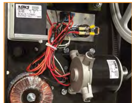
dc motor and battery backup for continued gate operation if AC power is lost