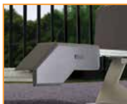
arm joint cover helps eliminate pinch points