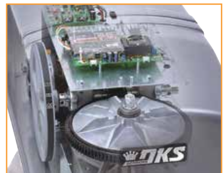
unique design simplifies installation and provides easy access to all internal parts