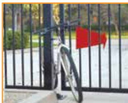
entrapment prevention system reverses gate on contact