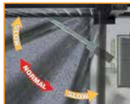
smooth operation no slamming when gate closes