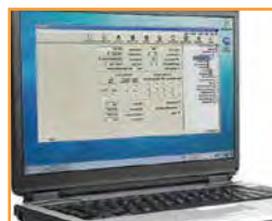
gate tracker reporting output