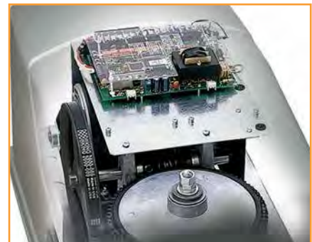
unique design simplifies installation and provides easy access to all internal parts