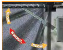
smooth operation no slamming when gate closes