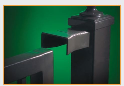
End Cap guides gate into final alignment.