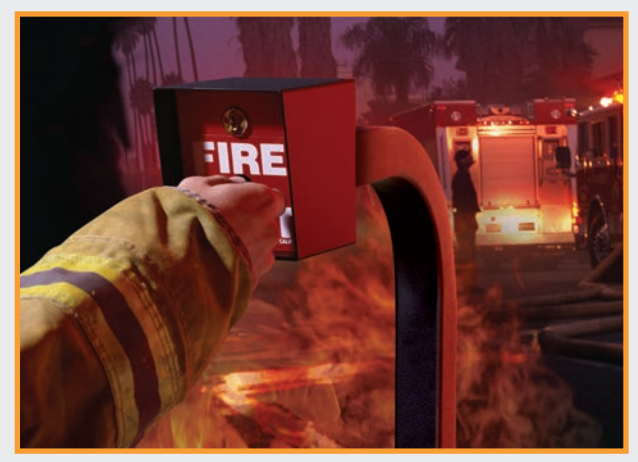
Lock Boxes allow quick access for Fire Dept. personnel.