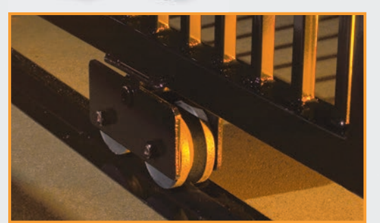
Tandem Assembly for heavy gates.