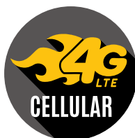
DKS Cellular Option™

Utilizes the POTS (Plain Old Telephone Service) line at the telephone entry system to provide data (programming) transfer via the internet connection at your programming computer.