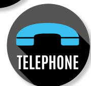
voice and remote programming use DKS service options for connection and programming