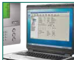
pc programmable easy to use software included