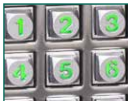
internal LED lit keypad and A-Z-CALL buttons