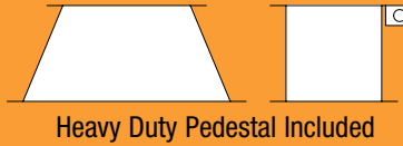
Heavy Duty Pedestal Included

Pedestal: 31.5" W x 12" H x 16.5" D (80cm W x 30.5cm H x 41.9cm D)