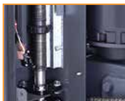
limit switches direct driven and easily adjustable