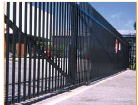
large gates up to 2000 Lbs