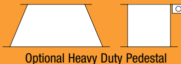
Optional Heavy Duty Pedestal

Optional Pedestal: 31.5" W x 12" H x 16.5" D (80cm W x 30.5cm H x 41.9cm D)