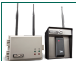
wireless expansion up to 24 entry points