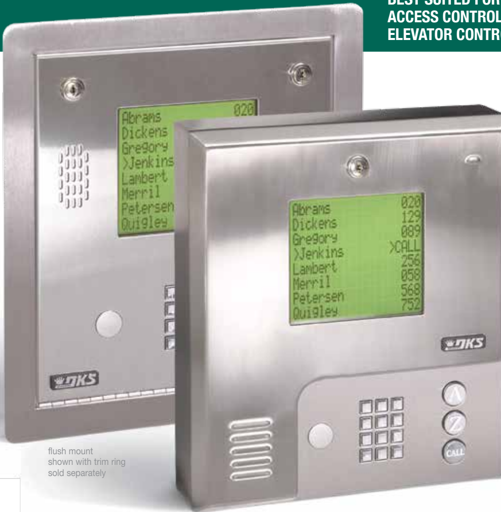
flush mount shown with trim ring sold separately

BEST SUITED FOR APPLICATIONS REQUIRING COMPLETE ACCESS CONTROL FOR UP TO 16 ENTRY POINTS, INCLUDING ELEVATOR CONTROL