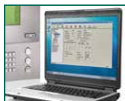
pc programmable easy to use software included