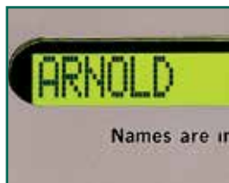
big characters half inch LCD display