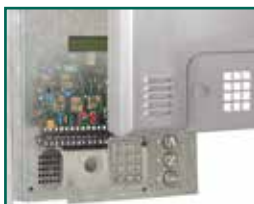
stainless steel plate and anti-vandal features protects all internal parts