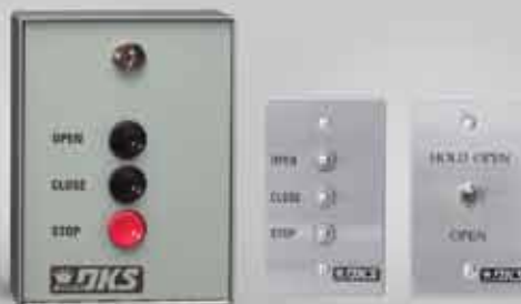
Gate Control Stations

DKS control stations can be used in a variety of applications to meet basic access control or automated gate control requirements. These interior controls are designed to mount into a single-gang electrical box and are built with a stainless steel faceplate. Lighted exit buttons provide free exit while key switches and keypads are used to control entry. Gate control stations provide complete manual gate control for DKS gate operators. Unique logic inputs found on DKS gate operators require only 3 wires for Open, Close, Stop operation.