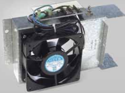
Model 1601-093 Fan Kit