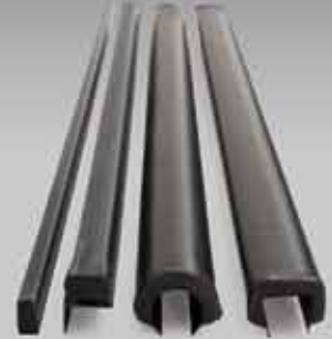
Contact Sensing Edges