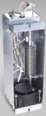
Model 1601-154 Heater with fan