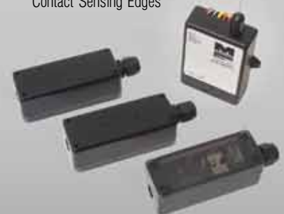
Wireless Edge Devices