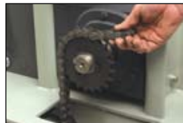
no slip chain drive #100 roller chain