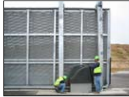
large gates up to 20,000 Lbs