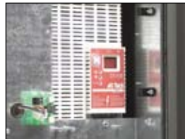
solid-state variable speed control