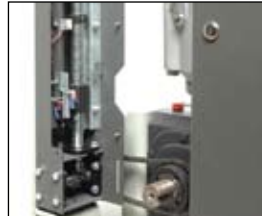
direct drive limit switches